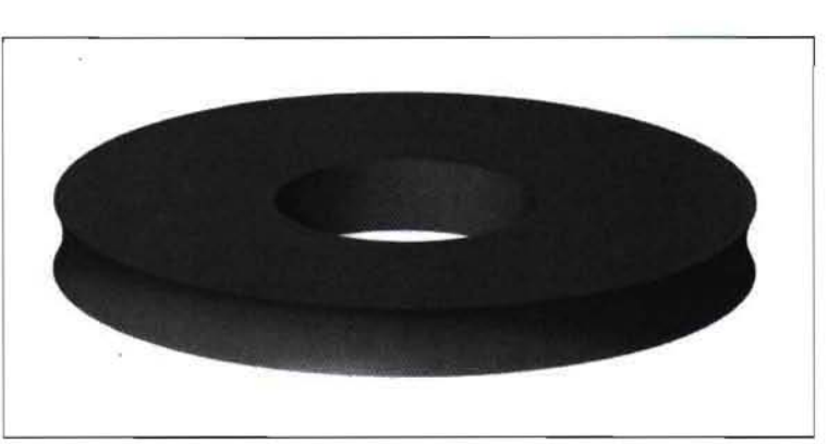
Figure 3: Stem Gasket

Concurrent with spray performance testing, the valve company will also determine a suitable stem gasket. This testing consists of exposing the product formula to a series of available gasket materials—typically Buna, Butyl, Neoprene and Viton. Initial (time zero) test readings include gasket thickness and durometer measurements. Durometer is the relative hardness of the gasket material. After baseline measurements are taken, the gaskets are placed in a container and submerged in the formula. In some cases, the propellant is also included in the test and a sealed aerosol can is used to contain the formula + propellant + test gaskets. The sample set is re-evaluated at seven and 30 days. At these intervals, the gasket thickness and durometer are